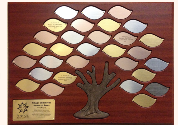
Recognition Plaque at Village Hall.